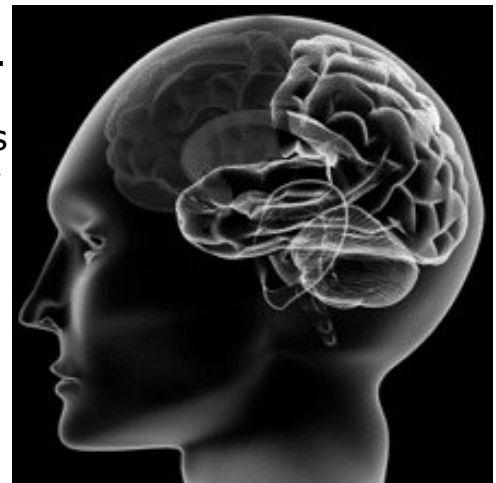
National Institute of Health

Most of us failed to keep a detailed record of why we commenced recovery or what those first two weeks were like. Without a record to remind us, we're forced to rely upon our memory to accurately and vividly preserve the truth, the whole truth and nothing but the truth. But now, the memory in which we placed our trust