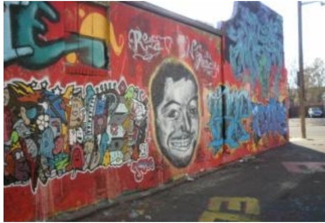
Graffiti mural in Denver painted by a friend. "Rest In Peace"