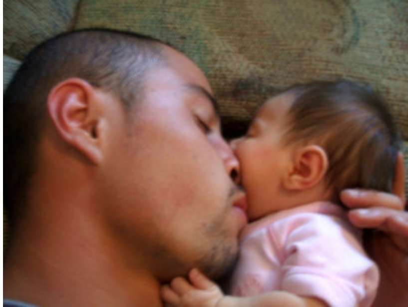
With his baby daughter, before diagnosis

soft late-summer air on his skin. He did not ask to see his baby daughter's face. He did not ask for his beloved dog, or for his brother, or for his mother. He asked for a smoke.