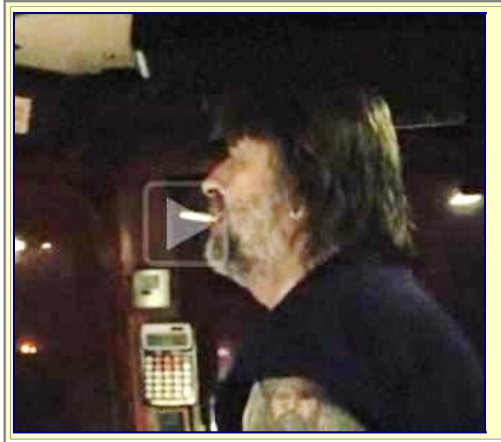
Captain Phil Harris - age 53 - "Deadliest Catch" crab boat skipper * stroke