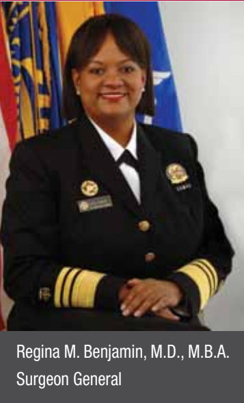
Regina M. Benjamin, M.D., M.B.A. Surgeon General