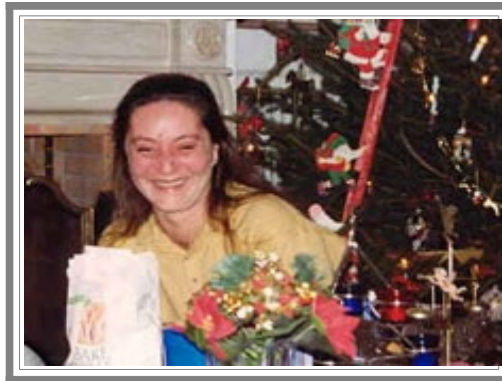
December 25, 1998 - The best Christmas ever!