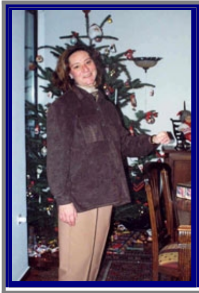
Presents under the tree and a special gift in me!